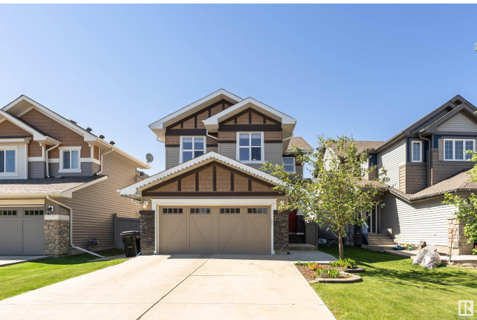
1515 Chapman Way SW, Edmonton, AB

MLS® # E4419964 Price $569,900 Bedrooms 3 Bathrooms 2.50 Full Baths 2