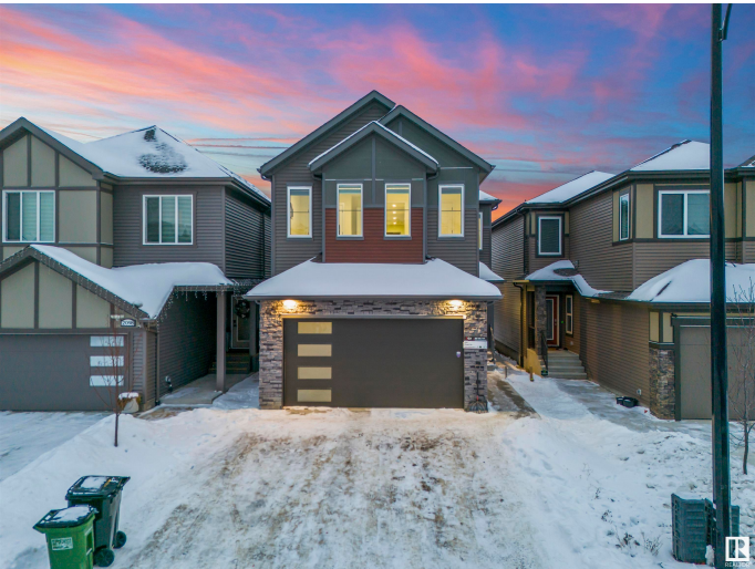
2096 Graydon Hill Cres SW, Edmonton, AB

1st Floor Exterior Area 1223.15 sq ft Interior Area 1121.19 sq ft Excluded Area 170.94 sq ft